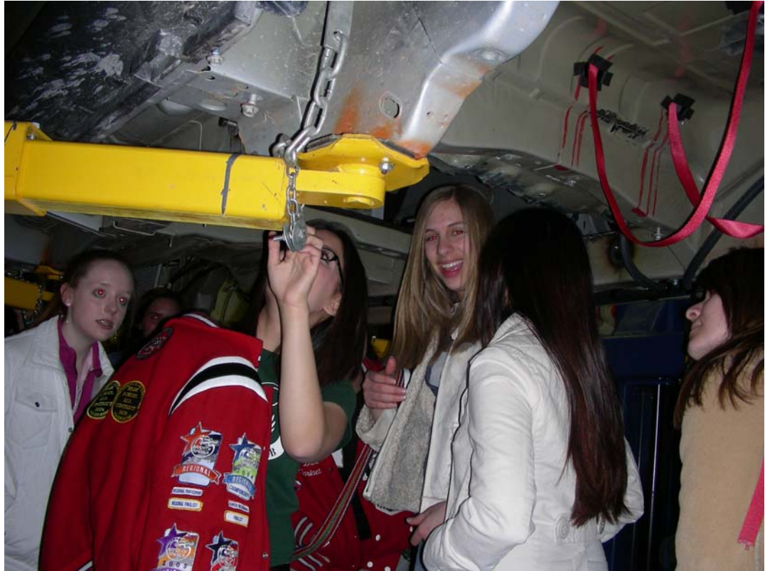
Girls look at the stripped-down Equinox.