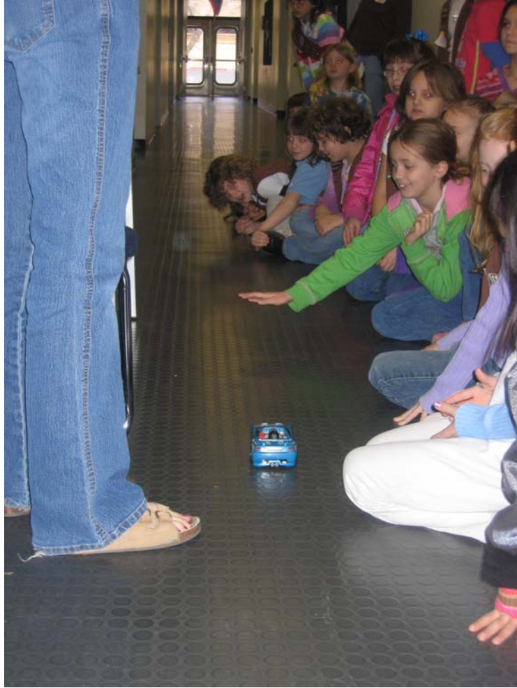
The girls discover new automotive propulsion systems at TU's Brownie Day.