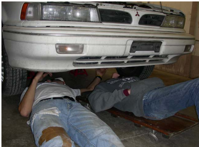
And they learned to change the oil in a car.