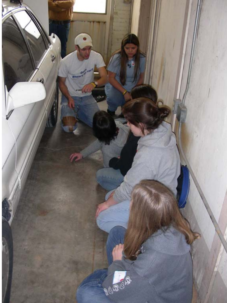
They learned how to change a tire.