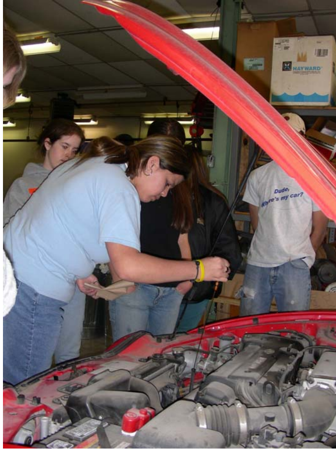
The girls learned to check the fluids in a car.